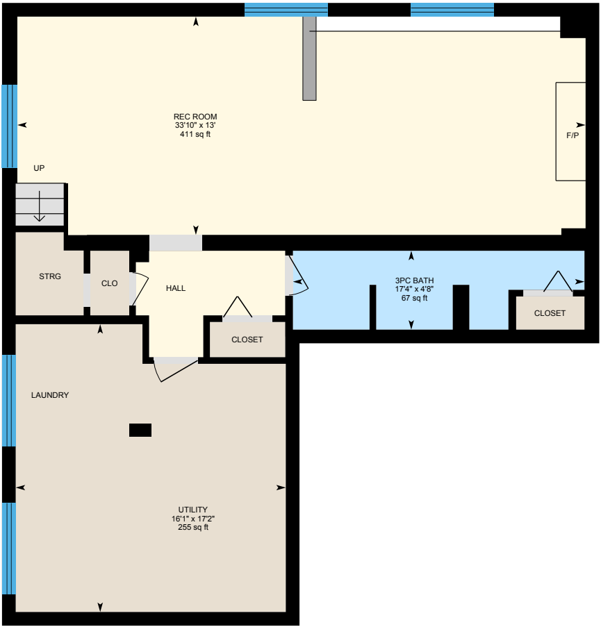
Basement (Below Grade) Exterior Area 1001 sq ft