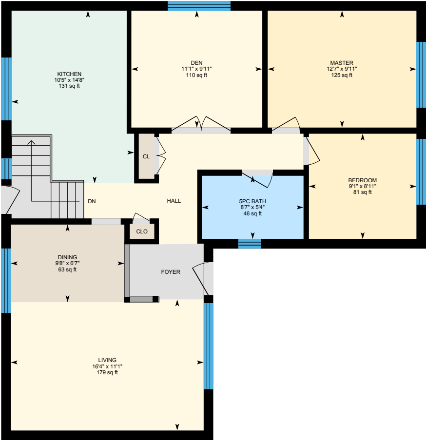
1st Floor Exterior Area 1047 sq ft

Main Building: Total Exterior Area Above Grade 1047 sq ft